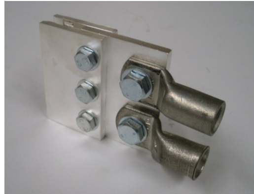
Temporary cable connection onto 6.35mm busbars (approx 2000A)