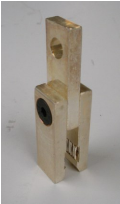
Contact for electro-winning cell. (approx 600A)